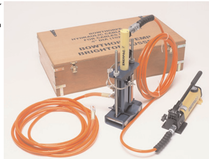
Cable Spiker Kit :- F-CSTE

All component parts are supplied in a stout wooden carrying case.